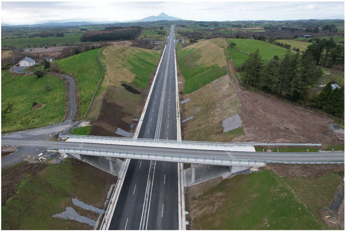
Drumneen Road Overbridge