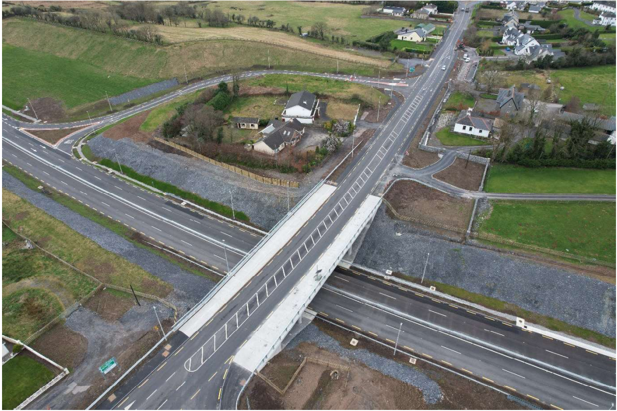
N60 Breaffy Road