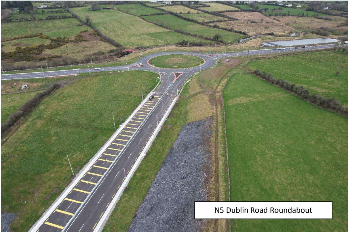
N5 Dublin Road Roundabout