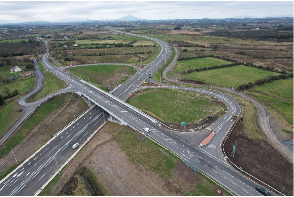
N84 Ballinrobe Road