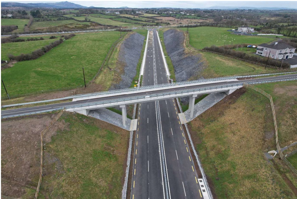
Windsor Road looking back towards N5 Dublin Road Roundabout