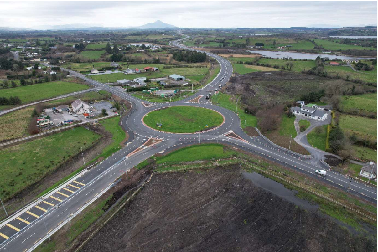
N5 Derrylea Roundabout