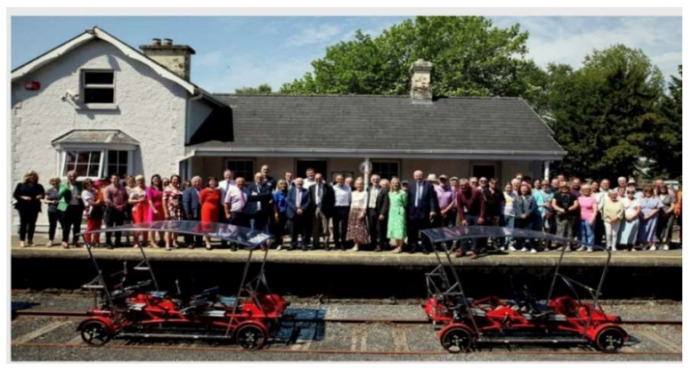
Kiltimagh Velo Rail Opening

On Friday 9<sup>th</sup> June 2023, Ireland's first Velo Rail Project was officially opened by Deputy Michael Ring TD, The Velo Rail is a new sustainable tourist attraction located in Kiltimagh, it is a unique and fun experience for visitors of all ages. The Velo Rail allows users to pedal along a disused railway line. The old disused railway line was repurposed to accommodate this new experience.