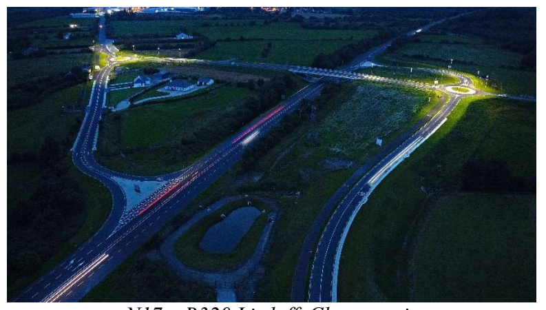
N17 – R320 Lisduff, Claremorris