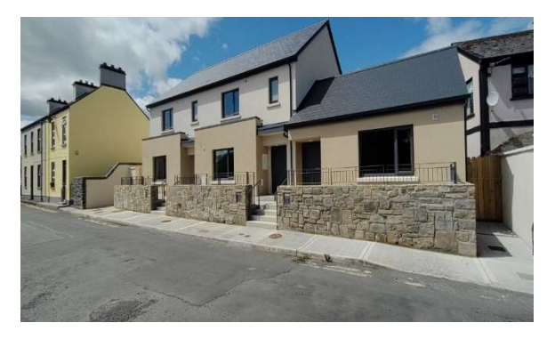
Units completed at The Boreen, Crossmolina