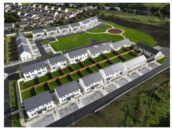
Rehins Fort, Ballina Completed September 2023

Mayo County Councils Architects Department, encompasses a large range of in-house technical expertise incorporating Architects, Engineers, Architectural Technicians, Clerks of Works, Surveyors, Horticulturalists and Clerical Staff, located throughout the County.