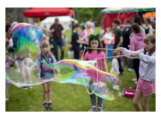
Onsight 2023 – 25<sup>th</sup> Anniversary of Mayo Artsquad, celebration of Community and Art