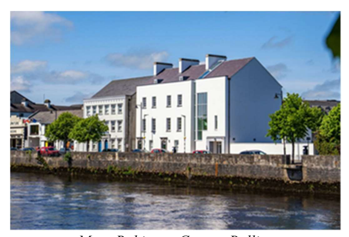
Mary Robinson Centre, Ballina

We will continue our commitment to Rebuilding Ireland in 2024 which will see the commencement of the construction of new housing on sites including Achill Sound (20), Lower Charles St Castlebar (4), Church Manor Ballina (3), Ellison Street Castlebar (12), amongst others. There are also projects planned for Abbeyquarter Ballyhaunis (37), Belmullet (8), and Lawn Road Castlebar (28). We are also working on the following 3 separate sites in Ballina, Cheshire Homes (68), The Meadows (12) and Duffy's Bakery (28) these complimented by a host of smaller sites around the county, varying in size from 1 to 10 units.