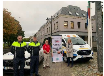
Figure 4 Road Safety week 2023

Authority with an information stand, Safe cycling Ireland, Go Safe van, Roads Policing Unit and The Educate Together National School.