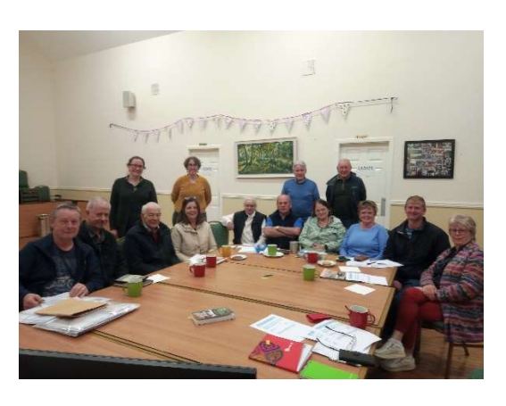
Field Names Recording Workshop Shrule