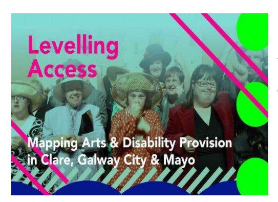
Levelling Access – Mapping Arts & Disability Provision in Clare, Galway City & Mayo