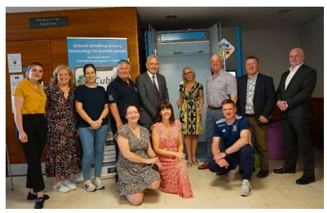
Launch of Sensory Cubbie in Belmullet Library