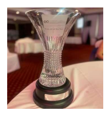
Figure 5 'Council of the Year' Award - LAMA Awards

Awards : In April Mayo County Council won the prestigious 'Council of the Year' Award at the LAMA (Local Authorities Members Association), the council was also shortlisted in a number of categories including 'Best Green Sustainable Initiative, Best Community Transport Initiative, Best Trail in Ireland, Best Tourism Initiative. In November Mayo County Council claimed two awards at the Chambers Ireland Excellence in Local Government Awards . Mayo County Council were named as winners in the Climate Change Award category and the Supporting Tourism Award category.