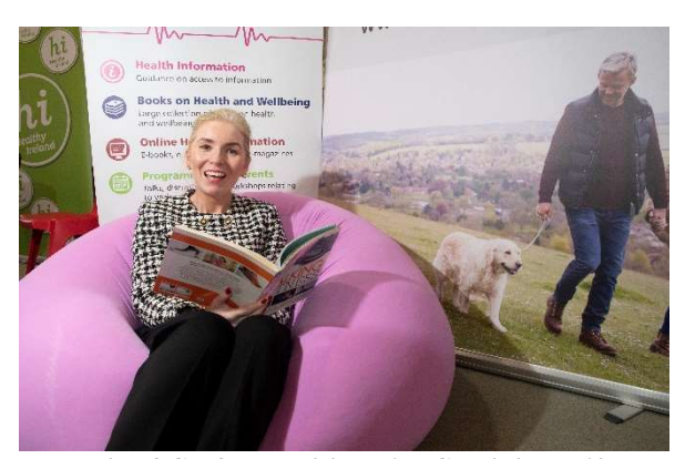
Launch of CROI Health Fair, Castlebar Library