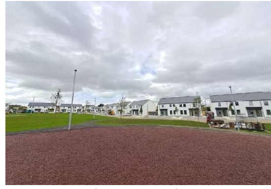
50 Unit Social Housing Scheme at Rehins Fort Ballina