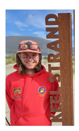
Lifeguard at Keel Strand

Mayo County Council provides ringbuoys at 558 locations in Co. Mayo and these are constantly inspected and monitored by Council staff in all Municipal Districts. The extreme weather conditions along the Atlantic coast occasionally results in coastal erosion and creates the necessity to replace ringbuoys and safety information signage, when necessary, at certain locations.