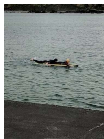
2023 Open Water Fitness Test – Lecanvey Pier