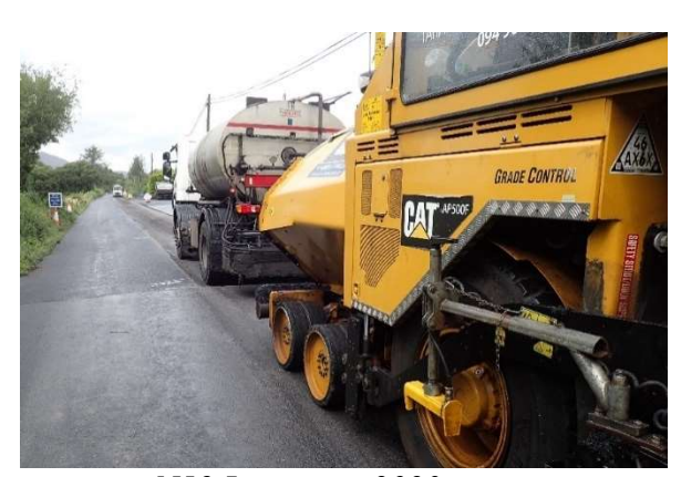
N59 Liscarney 2023