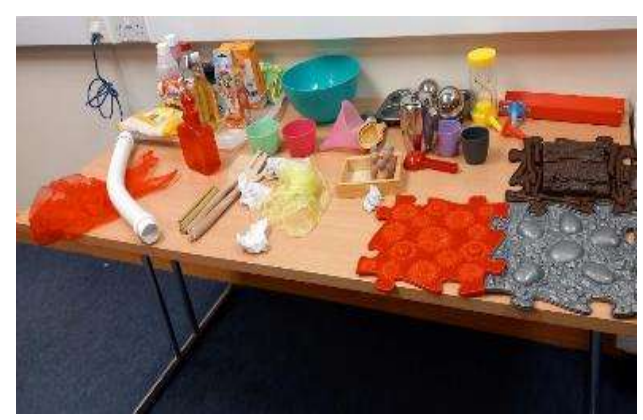
Childminding network on Sensory play in MCCC offices – Aug 2023