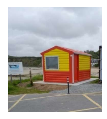
New hut on-site at Carrowniskey Beach

World Drowning Prevention Day on 25<sup>th</sup> July, 2023 was marked by our Lifeguards by wearing blue face paint to remember the victims of drowning around the world.