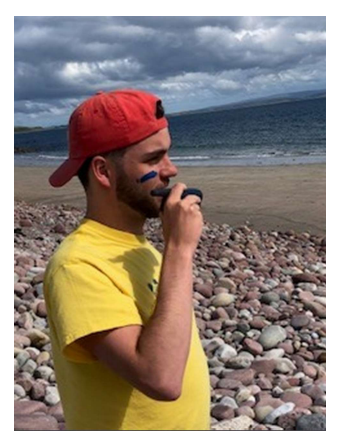
Lifeguards on duty at Mulranny

World Drowning Prevention Day on 25<sup>th</sup> July, 2023 was marked by our Lifeguards by wearing blue face paint to remember the victims of drowning around the world.