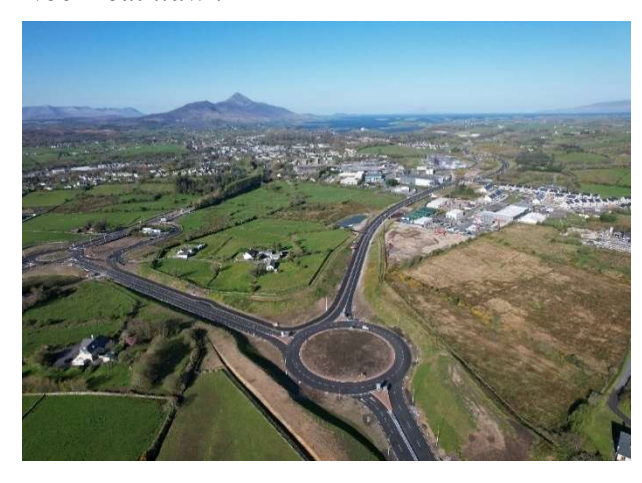
N17-R320 Lisduff N5 Westport to Turlough