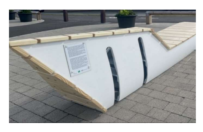
Wind Turbine Trail Furniture

The wind turbine blades furniture is the first street furniture made in Ireland. The end-of-life wind turbine blades which had previously generated power for over 15 years in Ireland that are normally consigned to landfill. By repurposing the blade waste from the wind energy sector, this decouples the generation of renewal energy from the production of waste and promotes sustainability and circular economy.