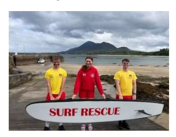
Lifeguards at Old Head Beach