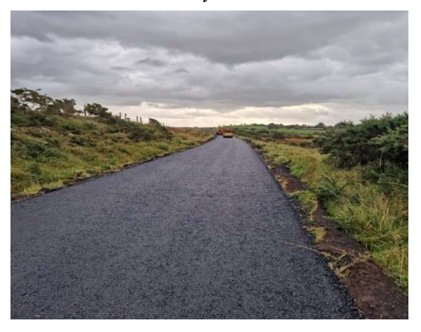
Surface renewal works on the Greenway