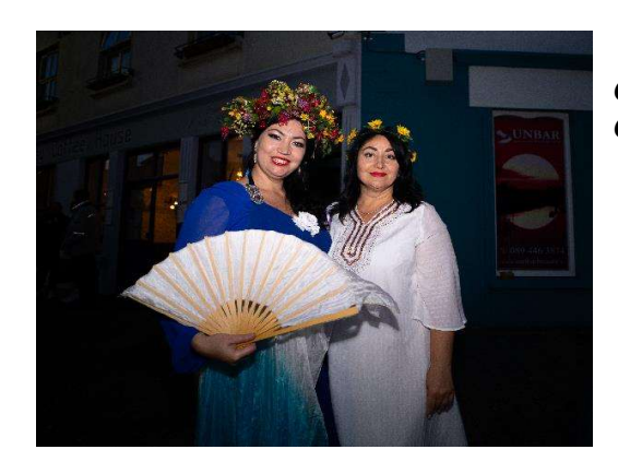
Culture Night 2023 – 'Where is Home' Culture Night Late Claremorris