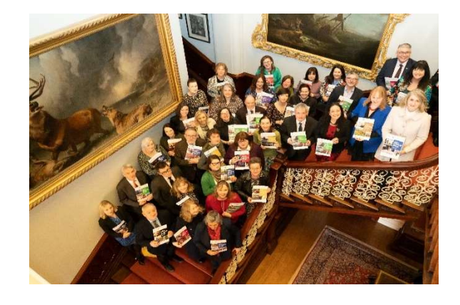
Launch of Creative Ireland strategies in Farmleigh House, Dublin in March