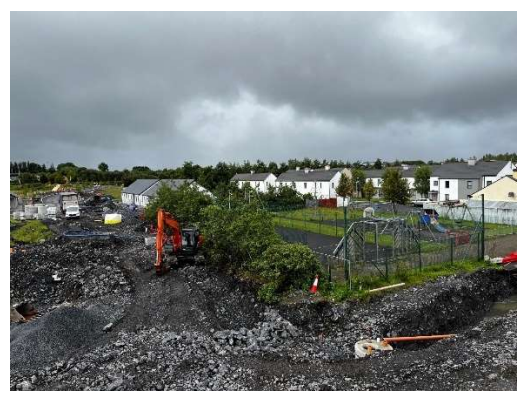
22 Units at Lios Na Circe, Castlebar.