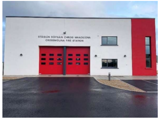
New Fire Station at Crossmolina

Capital grant aid was also received from the Department for the provision of a new Class B Fire Appliance and 2 number 4WD vehicles, all of which have been fully commissioned. They went on the run during 2023.