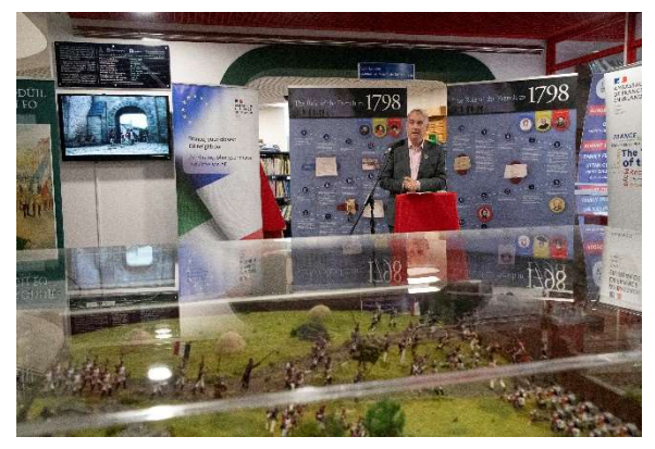
Launch of Year of the French programme in Castlebar Library